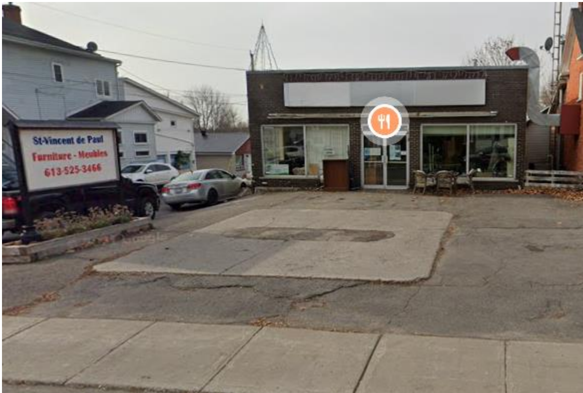
Existing sign at the road way